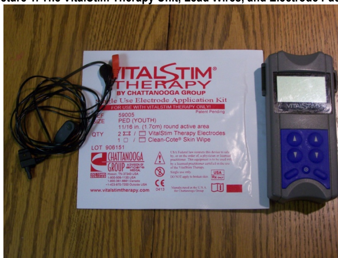
Picture 1. The VitalStim Therapy Unit, Lead Wires, and Electrode Packet

NMES is the use of electrical stimulation for activation of muscles through stimulation of the intact peripheral motor nerves. The major treatment goals are to strengthen weak muscles and to help in the recovery of motor control. 4,11 The Vital Stim® Therapy Unit is a dual-channel, electrically isolated device with miniature safety connectors. The unit is biphasic with a zero net DC and can deliver up to 100 volts maximum with no load. The dual intensity has a 0 to 25 mA peak current output with adjustable current. The pulse rate of the device is fixed at 80 Hz and the pulse duration is also fixed at 300 \mu seconds under normal operation. 5 (see Picture 1) Vital Stim® therapy is a FDA cleared device to promote swallowing through the application of NMES to the swallowing musculature. Four hundred forty-six (446) adult stroke patients demonstrated safe and effective treatment outcomes as a result of NMES and provided the basis for FDA approval of the device and electrodes. 6 The FDA imposed restrictions on the device so that it would not be used in any other way than that intended for use in strengthening musculature for swallowing. The goal of NMES is to strengthen muscles to improve motor control of the swallowing mechanism. 4