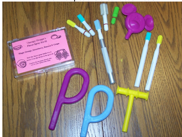
Picture 3. Examples of Oral Stimulation Tools

Used with permission from Vital Stim © User Manual. Chattanooga Group, Encore Medical Corporation, Austin, TX. 2005.